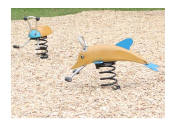
All Organic Robinia products by KOMPAN are made of 100% Robinia wood from sustainable European sources. On request it can be supplied with FSC® Certified (FSC® C004450) Robinia wood.