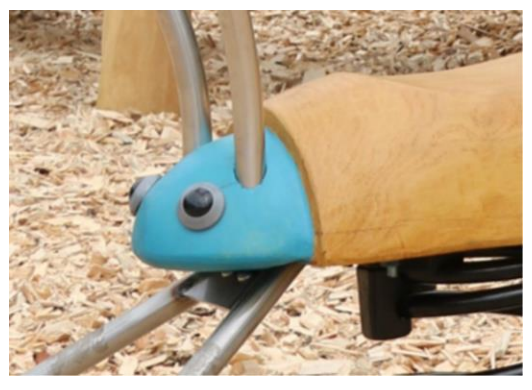
The paint used for coloured components is water based environmentally friendly with excellent UV resistance. The paint is in compliance with EN 71 Part 3.